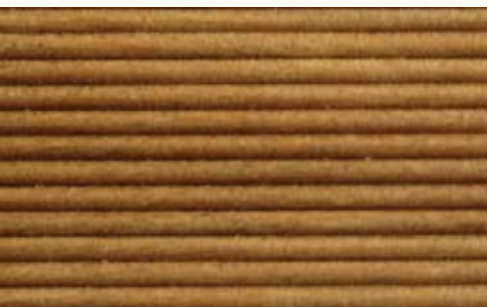
CUMARU 1900 x 2200 x 105 x 19 mm