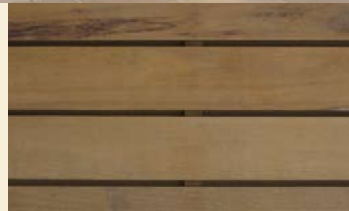
LAPACHO/IPE 2100-5700 x 100, 145 x 20, 21 mm