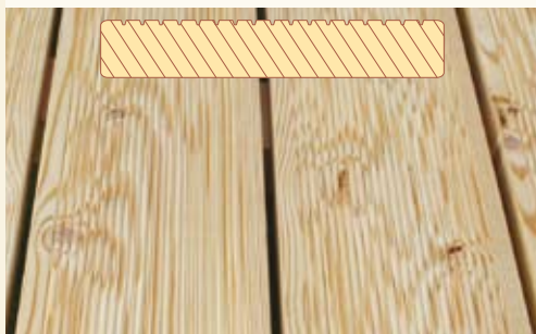
MACESEN SIBIRSKI 1x antislip about 4000 x 90/115/140 x 26 mm