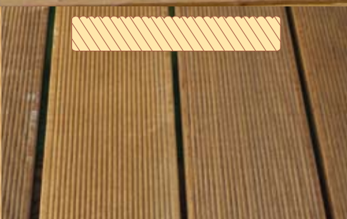
THERMO ASH 1x antislip about 4000 x 92/112/132 x 20 mm