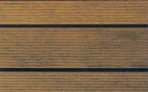
TEAK 2000-2400 x 100 x 20 mm