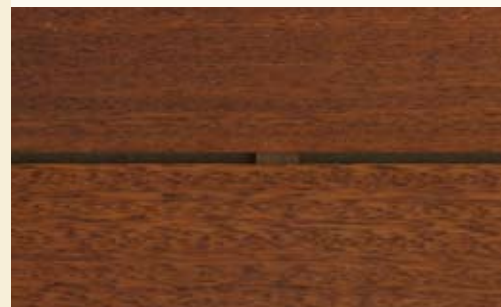
MERBAU 1800-5700 x 140 x 19 mm